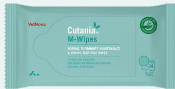
Presentation: 24 wipes. Size: 24 cm x 14 cm